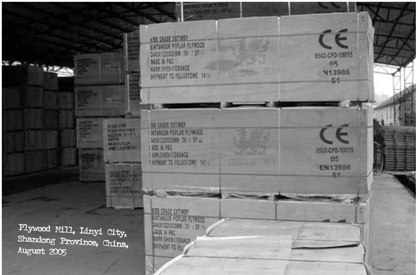
'Dragon ply' ready for export to UK where it is sold by companies such as Premier Forest Products. This plywood uses timber from Papua New Guinea's rainforests.