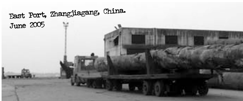
Log from Papua New Guinea at East Port.

Tracing back Chinese plywood openly displayed in UK builders' merchants, Greenpeace investigated this industry to find out what really goes into the plywood stocking UK shelves. In visits to eight plywood mills, eight veneer mills and several traders, the following picture was pieced together.