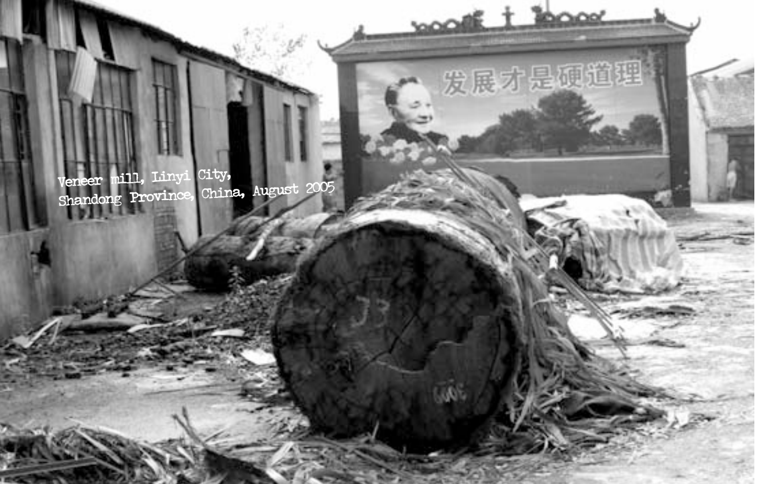
Veneer mill, Linyi City, Shandong Province, China, August 2005

An illegal Indonesian meranti log waiting for peeling to make plywood. Operations such as this are typical of China's plywood industry. The billboard shows the late Chinese leader, Deng Xiaoping and reads 'Progress is necessary'.