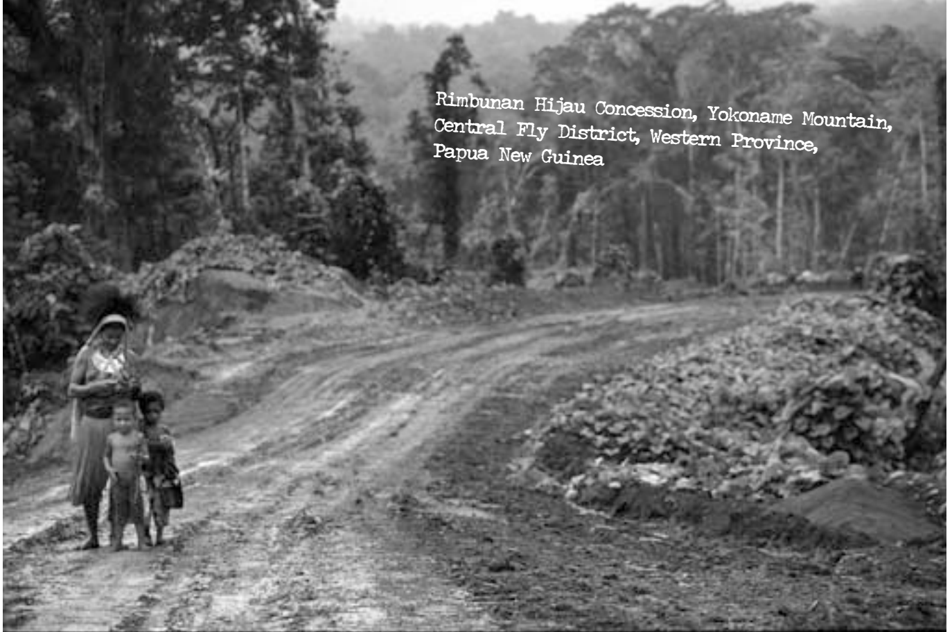
Logging by Rimbunan Hijau threatens Yokoname Mountain, the ancestral burial grounds of the Batamo Clan.

Rimbunan Hijau Concession, Yokoname Mountain, Central Fly District, Western Province, Papua New Guinea