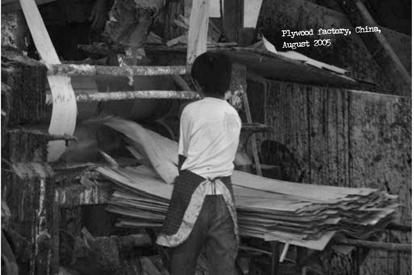
A girl working in a plywood mill in China that supplies rainforest plywood to Wolseley Build Centers in the UK.