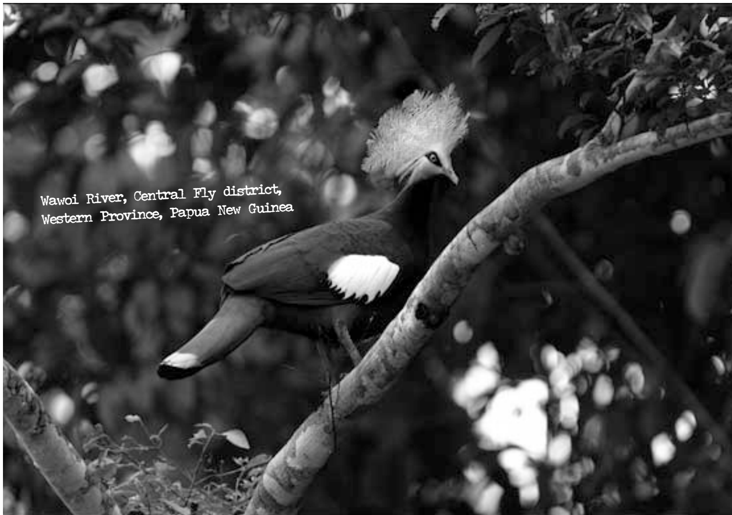
Wawoi River, Central Fly district, Western Province, Papua New Guinea