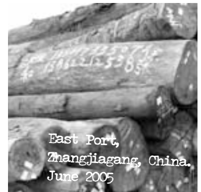
Logs from Papua New Guinea marked with mobile numbers make procuring illegal timber as easy as ordering a takeaway.