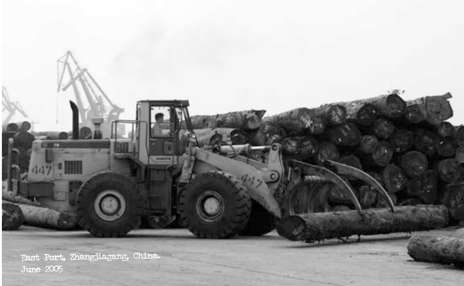
East Port, Zhangjiagang, China. June 2005

East Port in Zhangjiagang is the major port of import for logs from Papua New Guinea.