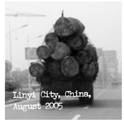
Truck loaded with African logs heads for processing into plywood.

All of the traders and mills investigated by Greenpeace confirmed that the rainforest timber used in plywood production came through Zhanjiagang. This is arranged either by buyers sent directly from the mill or by traders acting on a mill's behalf at the port. Decisions are made based on documents that may list only the ship name, and the volume and species available for sale. Traders pick the logs they want from the list, and then transport them to the mills for processing. Buyers also purchase logs at the port and transport them north for auction in the plywood producing centres. Despite repeated requests, none of the traders or mills investigated by Greenpeace was able to provide documents to indicate the legality or the sustainability of the timber on sale.