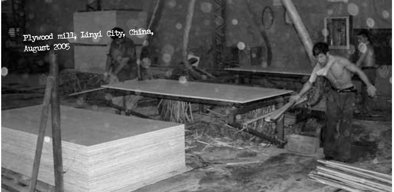
Dust obscures the view in this plywood mill. Workers labour in 35°C heat with little safety equipment.