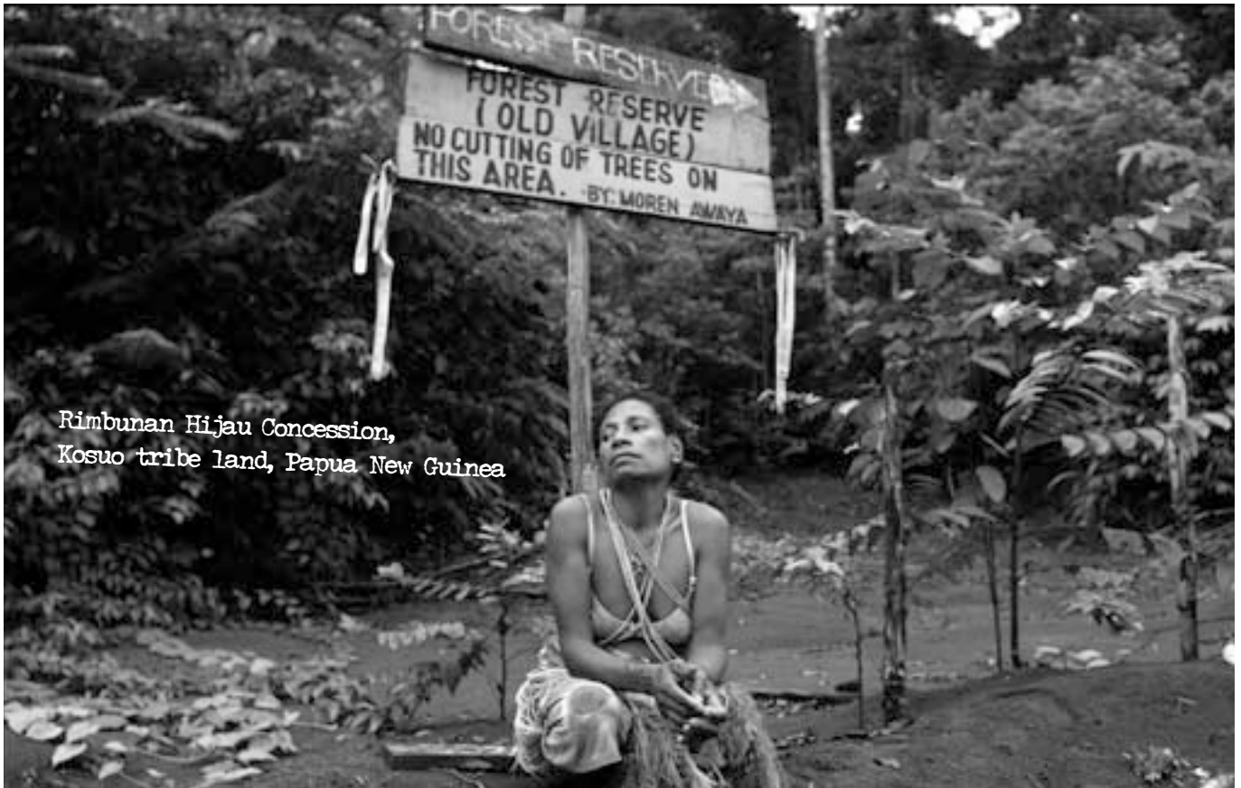
Rimbunan Hijau Concession, Kosuo tribe land, Papua New Guinea