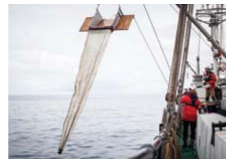
Sampling using a towed manta net, on Beluga II in Scotland, May 2017. The end of the manta net, the Cod End, is then removed and the contents sieved.

Surveys of the widespread problem posed by microplastics have been conducted at the sea surface in many areas around the world over the past few decades, but there is relatively little published information on their distribution in the waters around Scotland, or of their chemical characteristics.