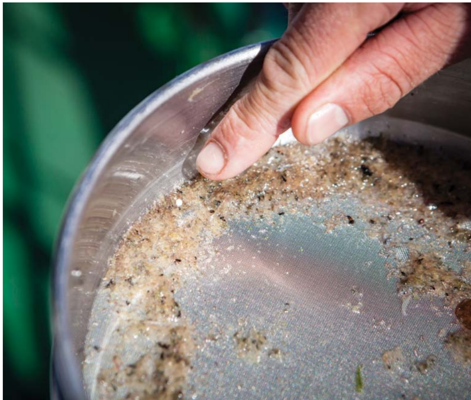
Sieving a trawl sample on board the Beluga II in Scotland, May 2017. The remaining contents of the sample were then bagged, frozen and sent to the lab for analysis.

Because of their synthetic nature and their propensity to adsorb, or attract, chemicals from seawater on to their surfaces, microplastics can also carry substantial concentrations of a range of chemical additives and contaminants (GESAMP, 2016), contributing to the exposure of marine species to hazardous chemicals (Browne et al. , 2013, Rochman et al. , 2013).